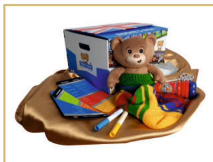
EDDIE'S BOX STARTER