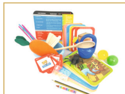
EDDIE'S BOX REFILL

Invest in your own language school and let the Teddy Eddie licence bring you success!