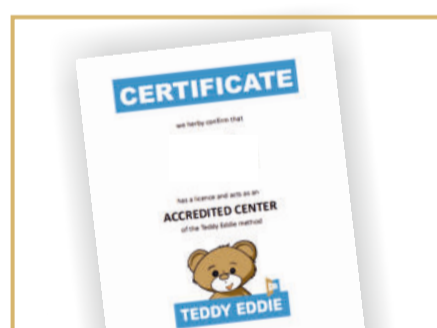
ACCREDITED CENTRE CERTIFICATE